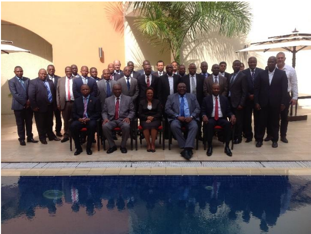
EXCO Members pose for a photo at the 40 th EXCO Meetings held in Dar es Salaam, Tanzania

The 40 th SAPP Executive Committee (EXCO) meetings were held on 31 st March 2016 at New Africa Hotel, Dar es Salaam, Tanzania. The meeting discussed progress on generation and transmission projects implementation, operational, trading and environmental issues in the SAPP. The meeting also discussed the outcome from the MANCO strategic workshop held on the 30 th of March 2016.