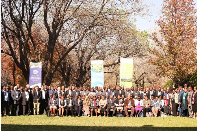
Delegates at the 7 th SADC River Basin Workshop

The SADC is implementing the SADC nexus dialogue whose overall objective is to support the transformation required to meet increasing water, energy and food security demand in a context of climate change in the region through development of an integrated nexus approach. To achieve the objective, SADC convened a River Basin Organization workshop whose objectives were: