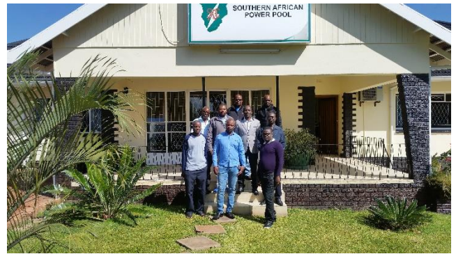
Some members of the SAPP Transmission Pricing Task Team at the meeting

determining energy interchange scenarios. They also tested the updated Transmission Pricing model using the SAPP PSSE base case file.