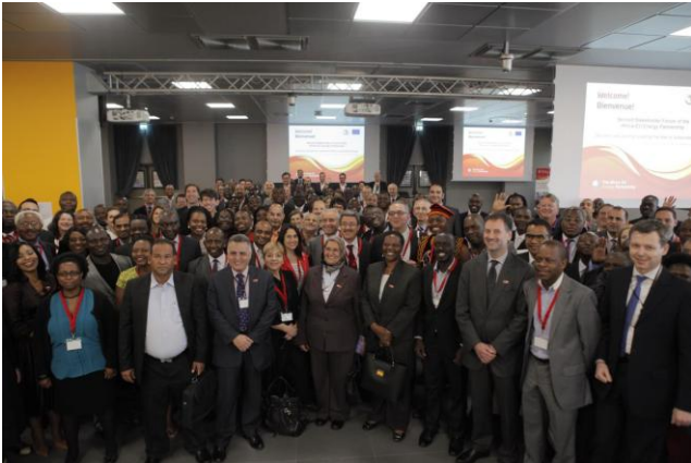
Participants at the AEEP Summit in Milan, Italy