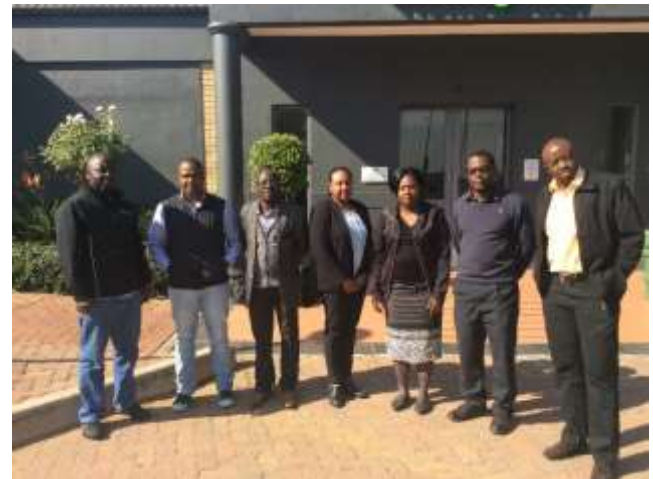
Some members of the SAPP MSC-IT Task Team at the meeting.