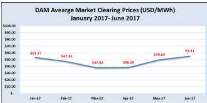
Daily Average MCP prices for the month of June 2017.

The monthly average Day Ahead market clearing price (MCP) was slightly higher during the month of June 2017 at 5.531USc/KWh when compared to the 4.964USc/KWh recorded in May 2017. Below is a summary of the daily average MCPs for the month of June 2017.