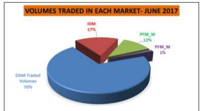
Traded Volumes in MWh in DAM, IDM, FPM-W and FPM-M for the month of June 2017.

Trading in the market was slightly lower during the month of June 2017 when compared to May 2017. Total traded volumes on the Day Ahead market (DAM), intra-day market (IDM), Forward Physical Market Monthly (FPM-M) and Forward Physical Market Weekly (FPM-W) decreased by 3.5% to 126,795.9 MWh in the month of June 2017, from the May 2017 figure of 131,363.4MWh. Below is the overview of volumes traded in DAM, IDM, FPM-M and FPM-W for the month of June 2017.