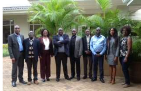
ZESCO, CEC and SAPP Coordination Centre on PDRA Mission in Zambia.

Electricity Company, ZESCO and Copper Belt Energy Corporation of Zambia.