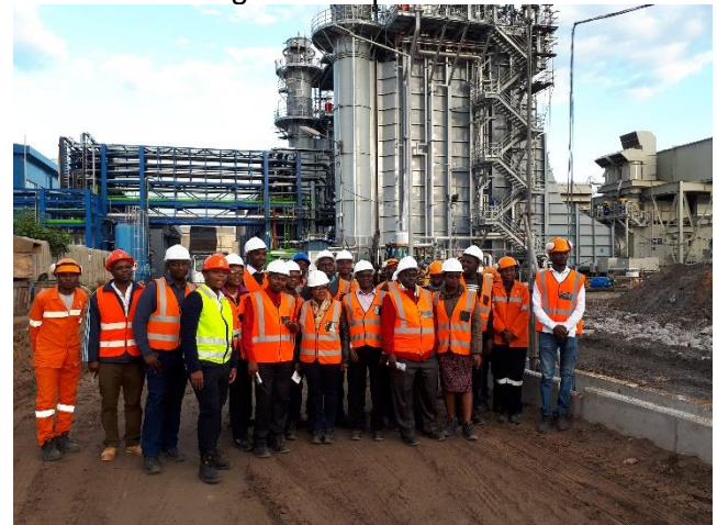
Some members of SAPP Power Quality Working Group at Maputo Gas Power Plant (under construction) in Mozambique

Power quality issues are becoming more prominent to regulators, power utilities and customers. A few years ago the SAPP formed a working group on power quality. The working group developed a SAPP standard for power quality as well as a specification for a SAPP power quality meter. Power quality meters have now been installed on most interconnectors in SAPP. From 4 to 5 July 2018 the SAPP power quality working group met in Maputo, Mozambique. The working group discussed monitoring and measurement of power quality. Common power quality problems and associated mitigation measures were also discussed. Members agreed to share power quality data in SAPP according to a set procedure.