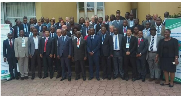
Some delegates of the AFSEC 6 th General Assembly in Abidjan, Côte d'Ivoire

declaration of the Conference of African Ministers of Energy held in Algiers on 17th February 2008. All users of electro-technical standards in African countries (electricity utilities, the national standards bodies, electricity regulators, consultants, contractors and suppliers of electrical equipment and services) are called upon to participate in the activities of AFSEC, by forming national electro-technical committees in their countries. Several countries, including Zambia and Namibia in the southern African Region, already have fully established committees, either as members of the IEC, or through the IEC affiliate country programme for developing countries. Zimbabwe officially joined AFSEC in 2017 and is in the process of forming her national electro-technical committees. National electro-technical committees are potential statutory members of AFSEC. AFSEC also recognises the importance of users of standards and has identified regional power pools, including Southern African Power Pool (SAPP), as potential affiliate members. AFSEC held its 6th General Assembly in Abidjan, Côte d'Ivoire, from 17 to 19 July 2018. SAPP was invited to observe the General Assembly (GA) and participate in the Conformance Assessment Committee (CAC) meeting and was represented by the Operations Engineer. As SAPP prepares to interconnect with East African Power Pool (EAPP), AFSEC is a good platform for harmonisation of electro-technical standards.