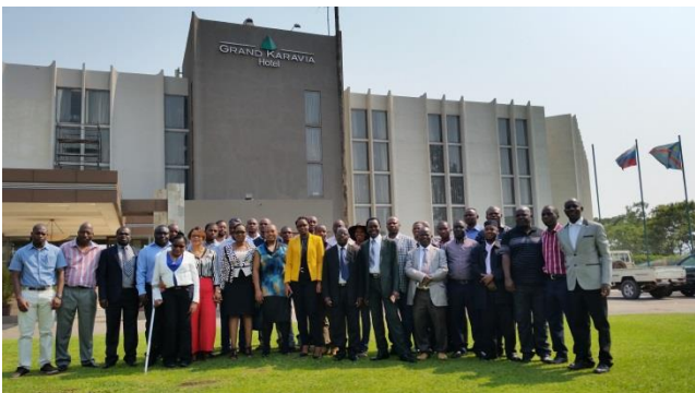
Some SAPP Energy Traders and System Controllers in Lubumbashi, DR Congo

The 12 th SAPP Energy Traders and System Controllers Forum was held in Lubumbashi, Democratic Republic of the Congo. Energy Traders and System Controllers discussed various issues affecting their jobs and made recommendations to the SAPP Operating and Markets Sub-Committees. During the forum, participants were also trained on the SAPP New Trading Platform. Lastly, participants visited the 220kV Poste Haute Tension de Karavia to familiarise with the \pm 75 Mvar Static var Compensator (SVC) which was commissioned in 2012 and assists in controlling voltage levels in the SAPP system.