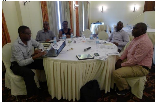
Some of the participants at the IRENA Training on Renewable Energy

The 1st Africa Renewable Energy Training Week (RETW) was convened in Arusha, Tanzania from 12 to 16 October, 2015. The course, hosted by IRENA is a tailor made capacity building exercise for the needs expressed by power system decision makers from the Southern African Power Pool (SAPP) and East African Power Pool (EAPP) region. The main objective of the course was to support the work of national and regional decision making bodies in Southern and Eastern Africa in order to integrate renewable generation resources into power systems, create an Africa-specific educational platform where regulators and decision makers will be able to observe and exchange experiences and best practices from across the globe.