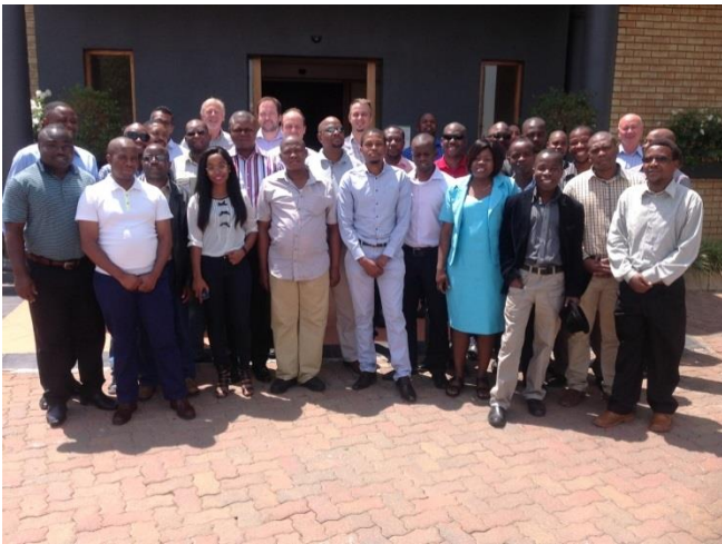
SAPP Traders pose for a photo during the SAPP-MTP certification training course in Johannesburg, South Africa

The SAPP has added other markets as part of its SAPP-MTP development. The market rules that are currently in place were developed with only the DAM market in mind. With the addition of other markets as part of the SAPP-MTP that include FPM-M, FPM-W and IDM, there is need to update the market rules. The MSC met initially in April 2015 and on 22-23 October 2015, a second meeting was held to finalise the market rules. The meeting managed to finalize the draft SAPP Market Book of Rules (MBOR).