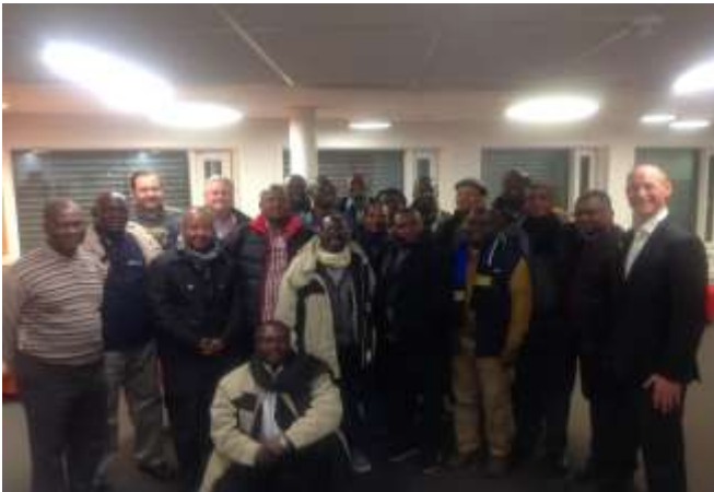
MANCO Members pose for a photo at NordPool Offices, Oslo, Norway