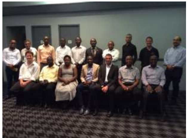
TWG Members during the meeting

The SAPP Telecommunications Working Group (TWG) held a meeting in Johannesburg, South Africa, from 01 to 02 November 2017. The meeting held discussions on the way-forward with the SAPP Video Conference System and came up with solid specifications of the system. Also discussed was implementation of cyber security before the Video Conference System is rolled out. The working group also discussed the use of the SAPP System Viewer and how best all utilities can benefit from it.