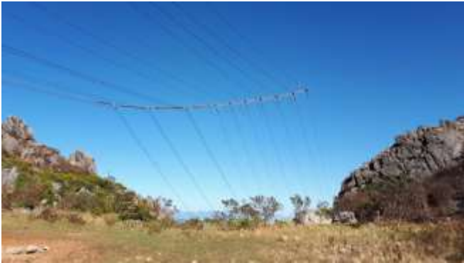
Eskom's unique "invisible tower" near Cape Town, crossing the mountain range and carrying 132 kV double circuit and 400 kV single circuit

"invisible" power transmission tower, a unique design and installation by Eskom. This tower does not affect the beautiful mountainous scenery of Somerset West in Cape Town even as it anchors one 400 kV and two 132 kV circuits plus their overhead earth wires across the mountain range.