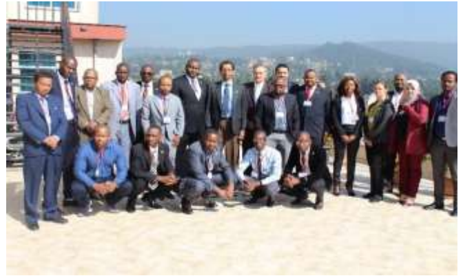
Energy Efficiency Workshop participants at Sarem International Hotel in Addis Ababa, Ethiopia

The creation of an accurate energy efficiency database will be of paramount importance in the analysis and development of energy efficiency policies. The National Focal Points appreciated a project done by the Food and Agriculture Organization, FAO in Lesotho about developing a methodology on incorporating a wood fuel module into existing household surveys and further asked AFREC to help financially and technically to put in place such investigations to the other countries. Countries that does not have Energy Information Systems were encouraged to develop their own National Energy Information Systems.