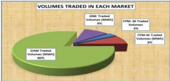
Traded Volumes in MWh in DAM, IDM, FPM-W and FPM-M for the month of November 2017.

Trading in the market was marginally lower during the month of November 2017 when compared to October 2017. Total traded volumes on the Day Ahead market (DAM), Intra-Day Market (IDM), Forward Physical Monthly Market (FPM-M) and Forward Physical Weekly Market (FPM-W) decreased by 8.6% to 224,142.10 MWh in the month of November 2017 when compared to the October 2017 figure of 245,163.30 MWh. Below is summary of volumes traded in DAM, IDM, FPM-M and FPM-W for the month of November 2017.