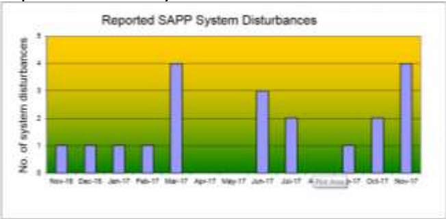
General outlook of reported SAPP System Disturbances

In the month of November 2017, four SAPP system disturbances were reported on the interconnected power system. Two originated from Mozambique due to faults on the HVDC system. The third one was caused by a broken conductor on one of the 220 kV Zambia - DR Congo tie lines. The fourth and last one resulted in power system excursions and power flow deviations on tie lines in the central corridor (Botswana, Zimbabwe and Zambia) and is still under investigation. Refer to figure below for a general outlook of reported SAPP system disturbances.