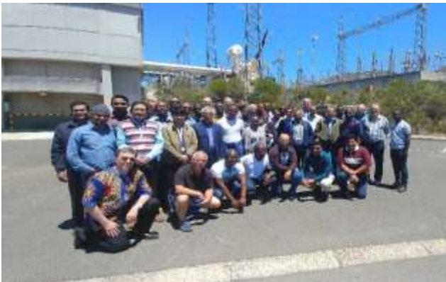
Group 1 of CIGRE conference participants at Palmiet Pumped Storage Power Plant in Cape Town