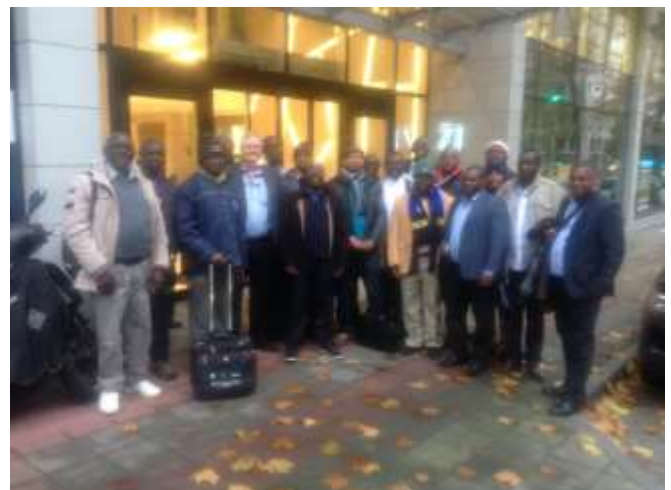
Some MANCO Members pose for photos at Coreso Offices, Brussels, Belgium