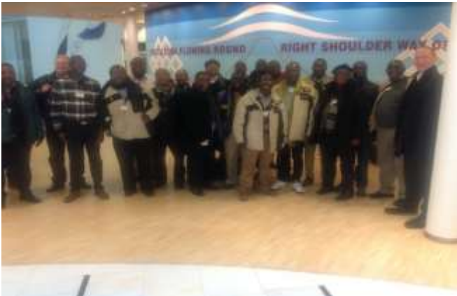
MANCO Members pose for a photo at Statkraft Offices, Oslo, Norway