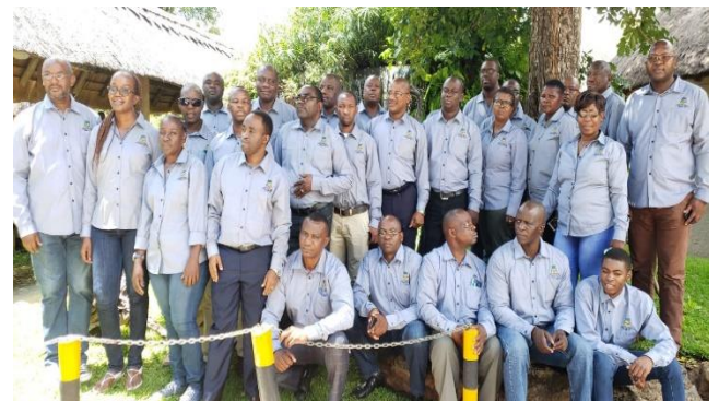
CPWG Delegates in Victoria Falls, Zimbabwe

The Crime Prevention Working Group (CPWG) held a meeting in Victoria Falls Town, Zimbabwe, 18 – 19 February 2020. The CPWG strives to put in place strategies to prevent theft and vandalism of the electrical infrastructure network in a bid to provide reliable and sustainable power supply in-line with the SAPP Mission. The SAPP network continues to be vandalised by criminals resulting in power outages and loss of valuable network infrastructure and revenue. The utilities present reported a total of 7,151 incidents on electrical and associated infrastructure and 2,327 other crimes. Strategies devised to address these crimes continue to be explored, with steady progress, though investment in technological advancements presents itself a tangible solution.