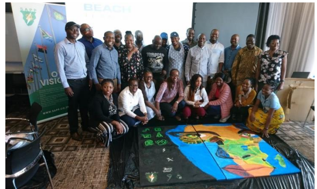
SAPP Staff attending Strategic Workshop

The SAPP carried out a strategic breakaway session in Cape Town, South Africa. The sessions included strategy sessions and team building activities. The team also worked on revising the SAPP vision, mission and culture.