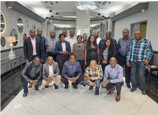
Some OSC members at the special OSC meeting in Johannesburg

On 21 February 2020 the Operating Sub-Committee (OSC) held a special meeting in Johannesburg, South Africa. The main focus of the meeting was power system disturbances. The meeting discussed causes and mitigation measures. The meeting also came up with an action plan for the following projects: The Agreement between Operating Members (ABOM) review, methodology for handling energy imbalance, and energy metering.