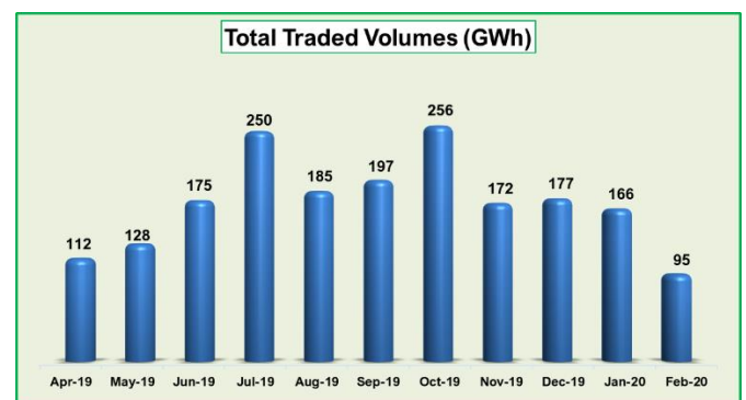
Monthly Traded Volumes (GWh) in DAM, IDM, FPM-W and FPM-M (April 2019 to February 2020)

Trading on the market was significantly lower during the month of February 2020 when compared to January 2020. Total traded volumes on the Day Ahead Market (DAM), Intra-Day Market (IDM), Forward Physical Monthly Market (FPM-M) and Forward Physical Weekly Market (FPM-W) decreased by 43% to 95 GWh in the month of February 2020, from the January 2020 volume of 166 GWh. The February 2020 traded volume was lower by 29% when compared to February 2019 in which traded volumes were 134 GWh.