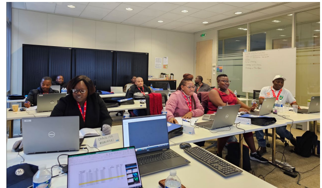
Training session on ICCP in Massy, France, for first group of SAPP member utilities

The SAPP Coordination Centre has commissioned an online power system viewer. The measurements and status of equipment are obtained through the Inter-Control Centre Protocol (ICCP) of the SCADA systems, currently only from Eskom (South Africa), ZESA (Zimbabwe), and ZESCO (Zambia). A training on ICCP was organised for SCADA engineers from the first group of SAPP member utilities in Massy, France from 6 to 10 March 2023. The second and last group would be trained in April 2023.