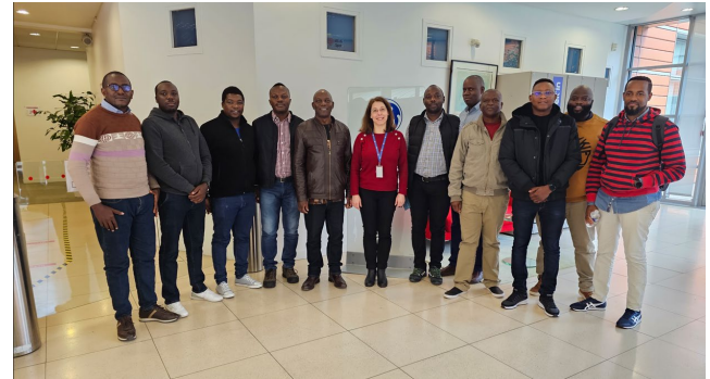
SAPP ICCP Training Participants in Massey

The SAPP SCADA training on Inter-Control Centre Communication Protocol (ICCP) was held in Massey, Paris, France, for the second group of SAPP utilities, including SNEL, CEC, LHPC, Ndola Energy, HCB, TANESCO, ESCOM, NamPower and RNT. SAPP Operating Members are required to share agreed power system data in real time using ICCP. This training was delivered by GE of France, who implemented the SAPP SCADA system at SAPP Coordination Centre.