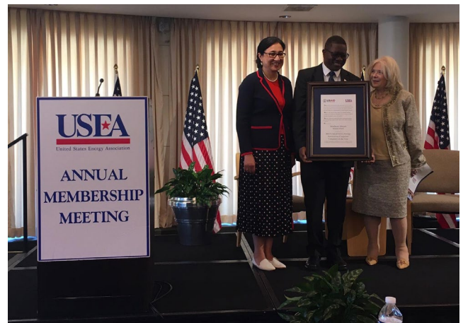
SAPP CC Executive Director receives the USEA Corporate Volunteer for 2023 in Washington DC

The SAPP was selected by the United States Energy Association (USEA) to receive their 2023 Corporate Volunteer of the Year Award and the SAPP CC Executive Director went to receive the award in Washington DC during the USEA Annual Meeting held on May 25, 2023.